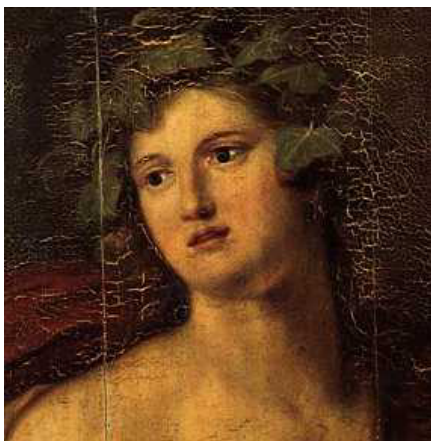
Josephine von Brunswick