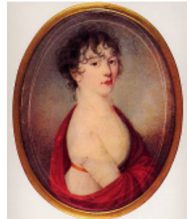
Countess Giulietta Guicciardi